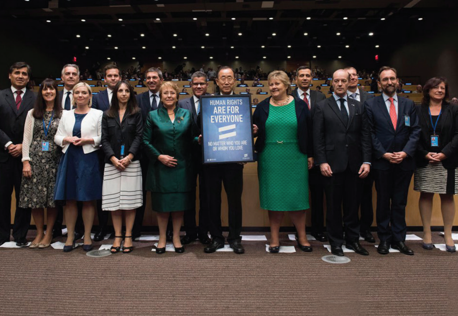
Former UN Secretary General Ban Ki Moon and members of the UN LGBTI Core Group

ity, race, ethnicity, origin, religion, economic or other status, which includes sexual orientation, gender identity or expression and sex characteristics. Former Secretary General Ban Ki Moon asserted that the aspiration is to ‘leave no one behind’, and that achieving SDGs will only be realised if member states reach all people, regardless of their sexual orientation or gender identity. 4