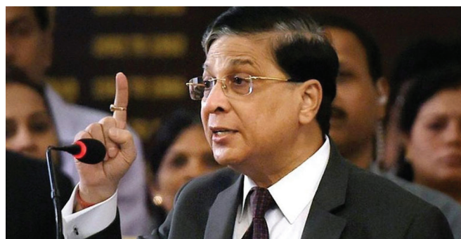
Justice Dipak Misra, 45th Chief Justice of India

In January 2018, Indian Supreme Court Chief Justice Misra and Justices Khanwilkar and Chandrachud spoke about the upcoming reconsideration of the ruling on decriminalisation of same sex acts noting that “sexual orientation and choice cannot be allowed to cross boundaries of law but confines of law cannot trample or curtail the inherent right embedded in an individual under Article 21 of Constitution.” 49