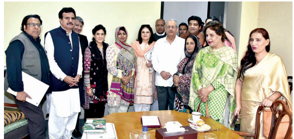
Senate Chairman Rabbani with transgender community representatives at Parliament in July 2017